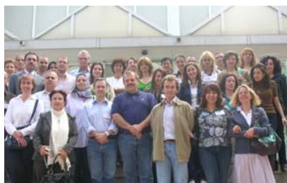
2° EpiSouth Training (Madrid 2008)