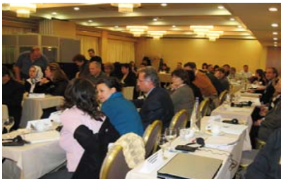
2° EpiSouth Project Meeting (Athens 2007)

ECDC-European Centre for Disease Prevention and Control, Stockholm, Sweden; EUROPEAN COMMISSION-DG SANCO Public Health Directorate, Luxembourg; MOH-Ministry of Work, Health and Social Policies, Rome, Italy; WHO–EMRO Regional Office for Eastern Mediterranean, Cairo, Egypt; WHO-EURO Regional Office for Europe, Copenhagen, Denmark; WHO-LYO Department of Epidemic and Pandemic Alert and Response, International Health Regulations Coordination, Lyon, France.