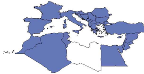
EpiSouth participating countries

Infectious diseases do not have geographical boundaries. Apart from a few for which a valid and efficacious vaccine is available, surveillance is the only instrument that public health personnel can use to contain the spread of epidemics.